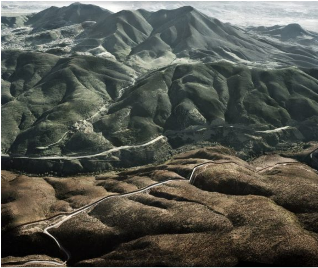
Pablo López Luz, San Diego – Tijuana XI, Frontera USA – Mexico , pigment print, 2015. Purchased with funds from the Escalette Endowment.

The idea to create border-based programming rooted in art was inspired by the Escalette Permanent Collection of Art , Chapman's "museum without walls." Curators of the Escalette Collection have intentionally collected works that engage with border issues. As the collection grew, it became apparent that students would need help contextualizing the artwork in order to experience it more fully. The programming, like the current border debate, continues to expand.